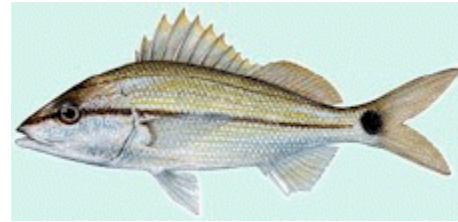
The Tomtate, Haemulon aurolineatum.

On my return, I learned that Professor Agassiz had been at the museum, but had gone and would not return for several hours. My fellow students were too busy to be disturbed by continued conversation. Slowly I drew forth that hideous fish, and with a feeling of desperation again looked at it. I might not use a magnifying glass; instruments of all kinds were interdicted. My two hands, my two eyes, and the fish; it seemed a most limited field. I pushed my fingers down its throat to see how sharp its teeth were. I began to count the scales in the different rows until I was convinced that that was nonsense. At last a happy thought struck me—I would draw the fish; and now with surprise I began to discover new features in the creature. Just then the professor returned.